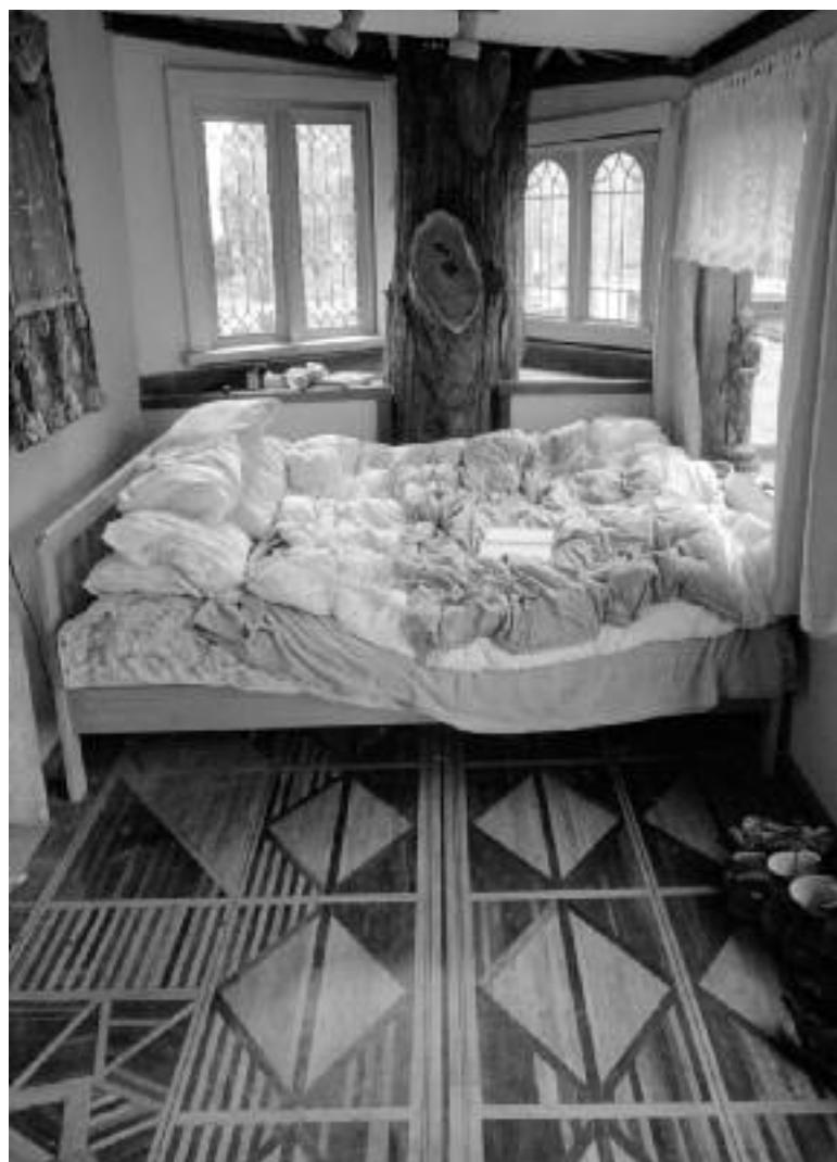
BARTON'S TREE HOUSE BEDROOM WITH INLAID FLOOR

JB: Part of what really has meaning for me is that everything I use is salvage. I mean, it's basically stuff that has no commercial value. Those doors, for instance. I found a whole pile of doors at an old school that was being torn down. They were covered with lead paint. Nobody wants to tackle all that old lead paint, but